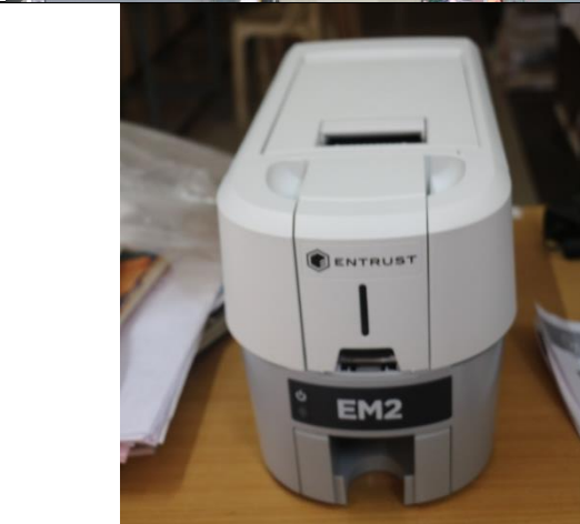
PVC Card Printer (ID Card)