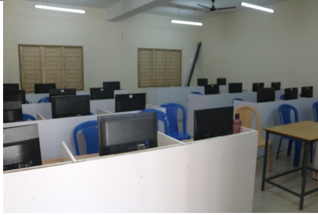
Digital Library with Thirty Desktop Computers with Internet facility of 20 MBPS Data Band